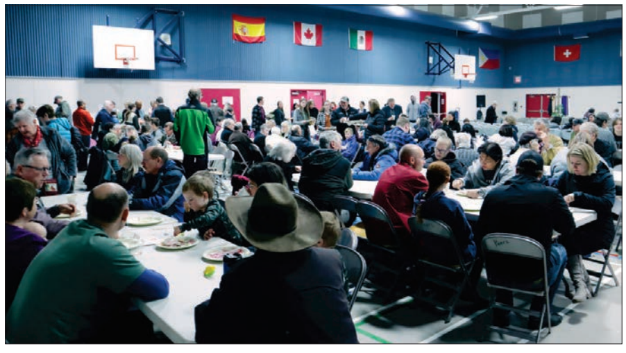
It was a great turn out at the Annual Good Friday Pancake Breakfast and Worship service on March 29. Over 350 people came out to enjoy free food and community.

For Chemical Spray Exemptions-"No Spray Areas", Questions or Concerns Contact Project Coordinator 1-403-370-7866