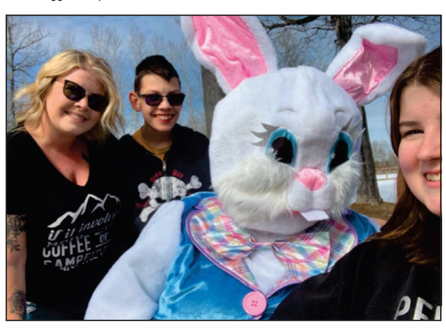
Kids of all ages along with parents and organizers celebrated Easter with the return of Marlboro's annual Easter Egg Hunt on March 31.