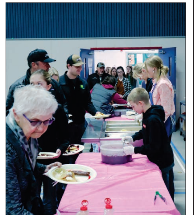
Adults and kids enjoyed a free pancake breakfast during the Good Friday celebration at YKCS.