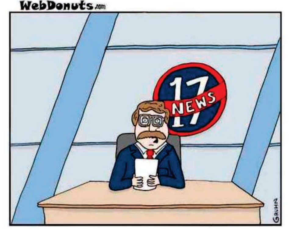
"And that's the way they want you to think it is."

Note: The views, opinions, and positions expressed in the column are the author's alone. They do not inherently or expressly reflect the views, opinions and/or positions of The Weekly Anchor or its staff.