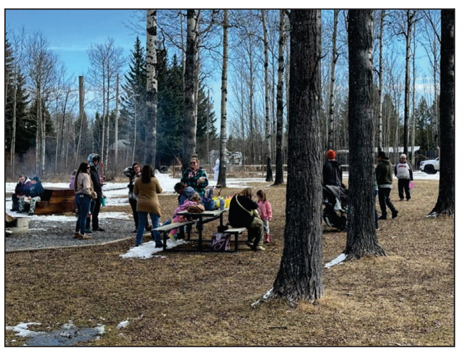
On March 31, the hamlet of Marlboro celebrated Easter with the return of their annual Easter Egg Hunt.

We thank all candidates for their interest; however, only those selected for an interview will be contacted. Candidates must possess a journeyperson trade certificate.